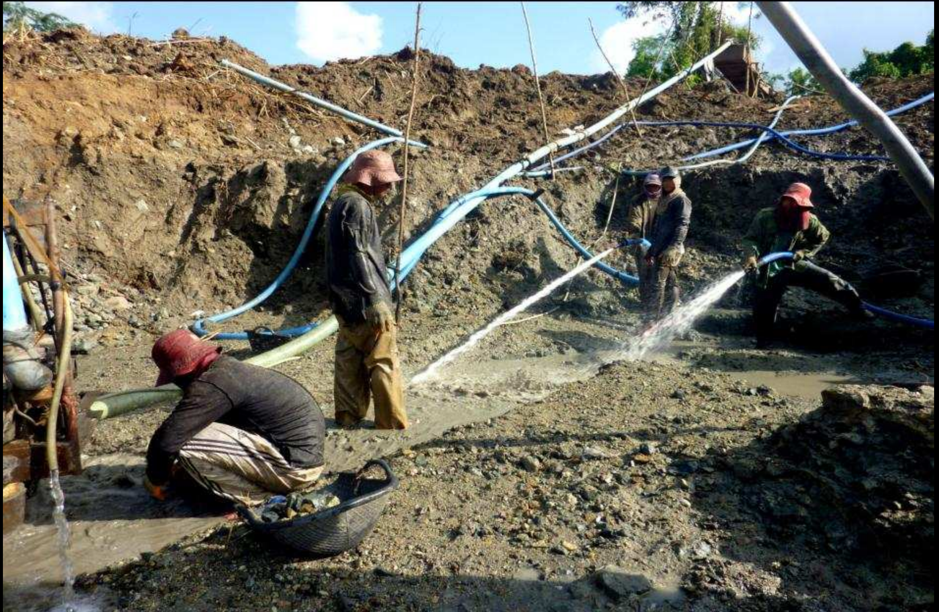
Mining in PAILIN. Cambodia.