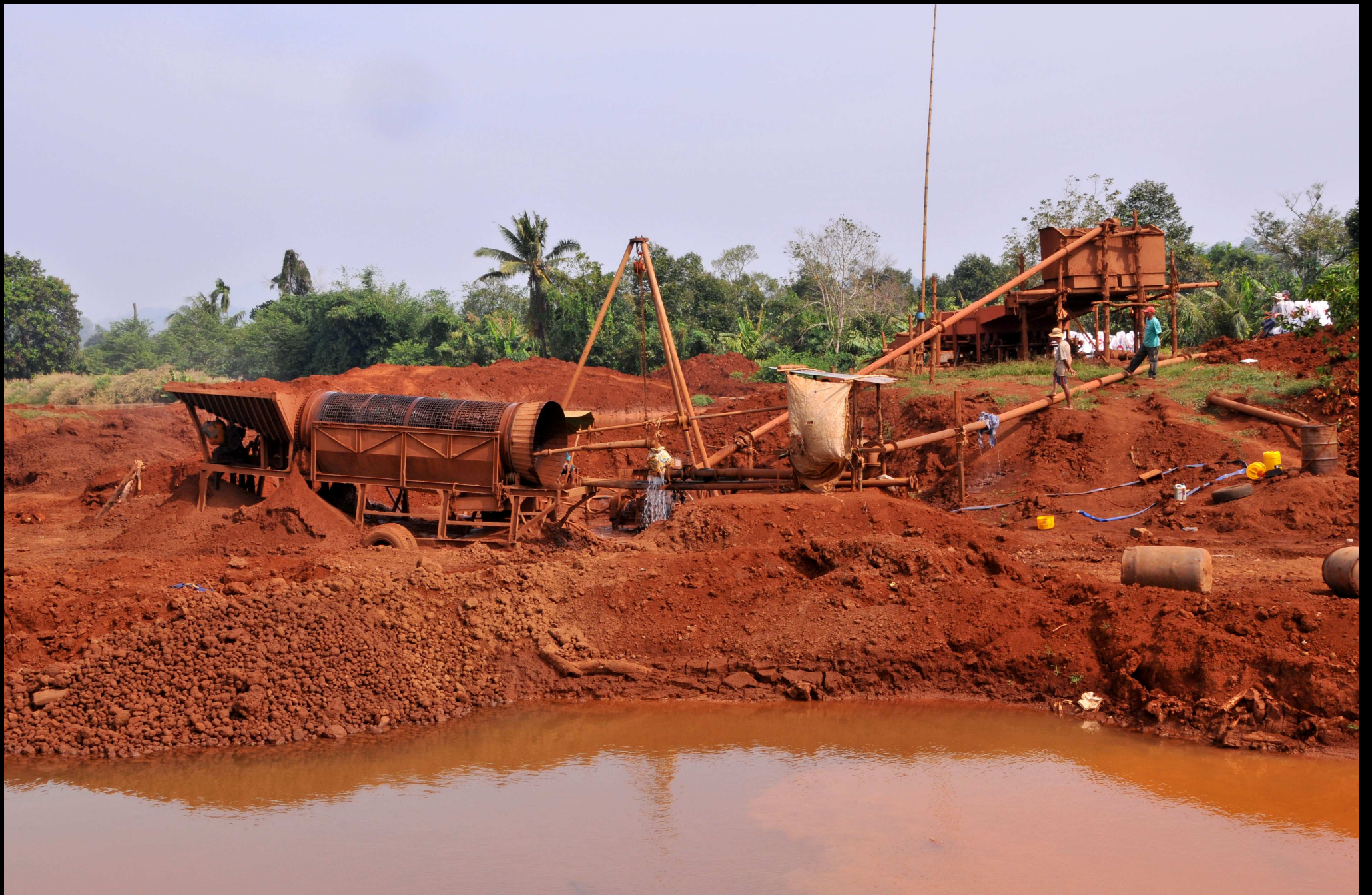
Sapphire mine in CHANTABURI