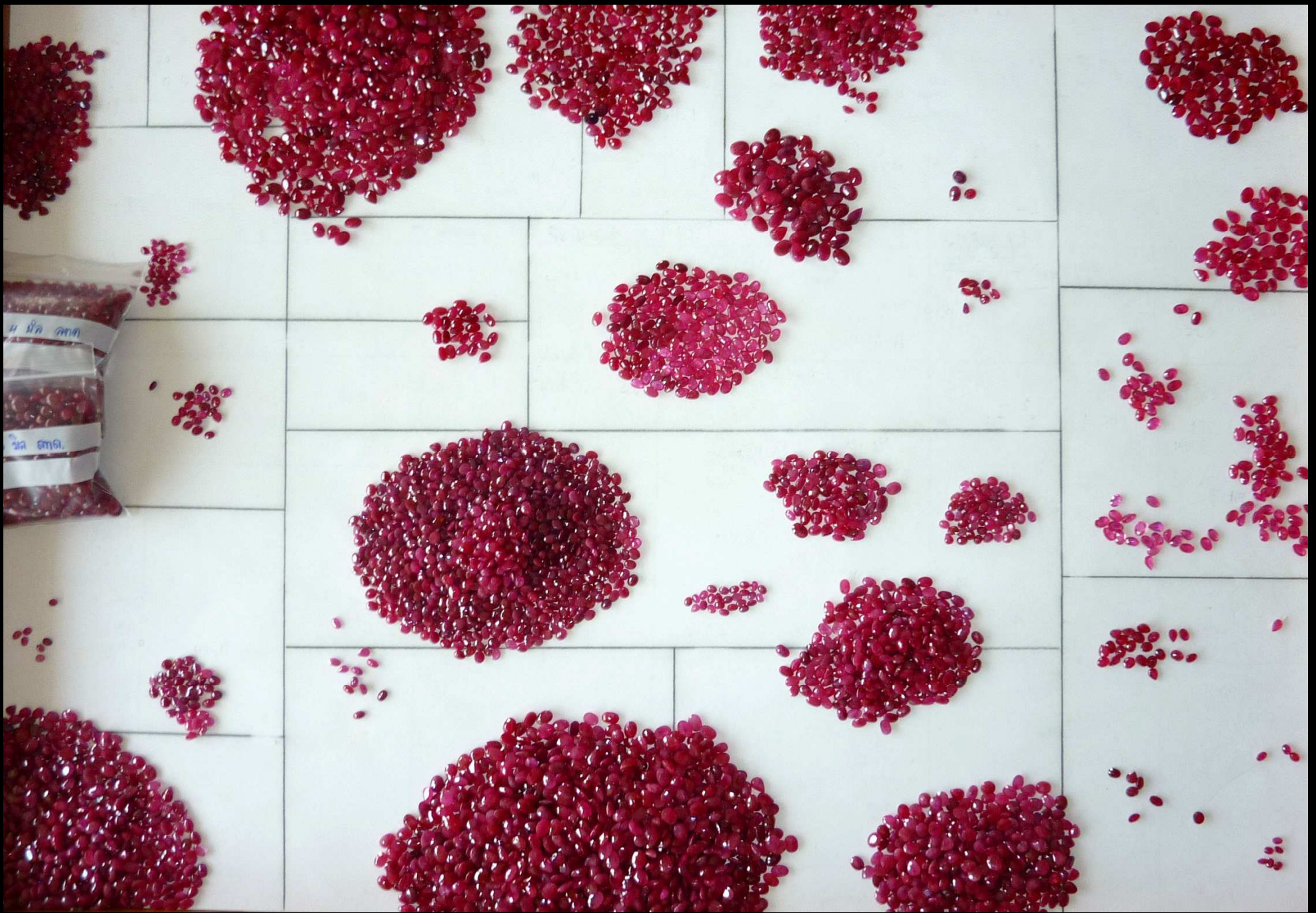
Burmese rubies seen in CHANTABURI