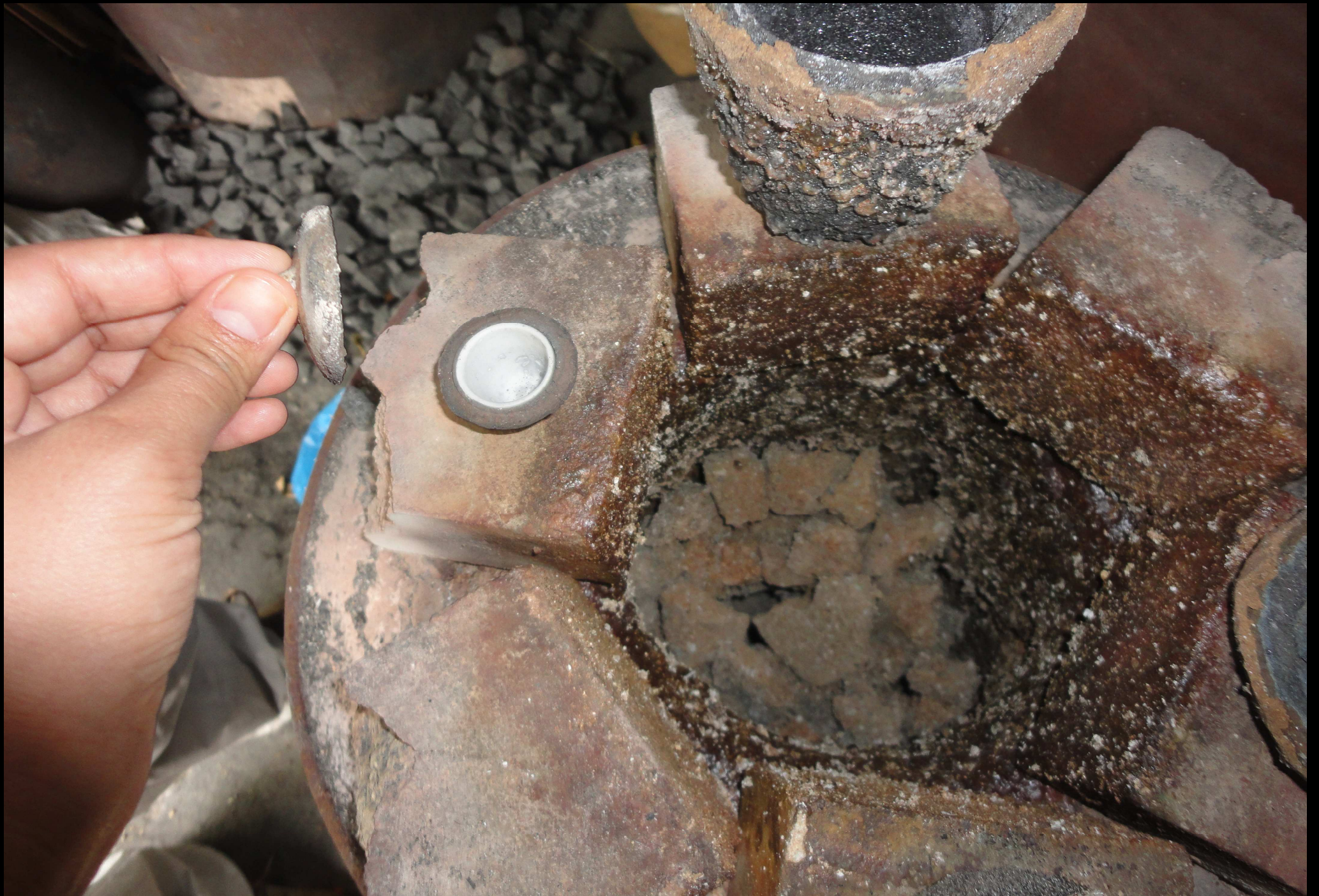
Visit to the main burner in PAILIN