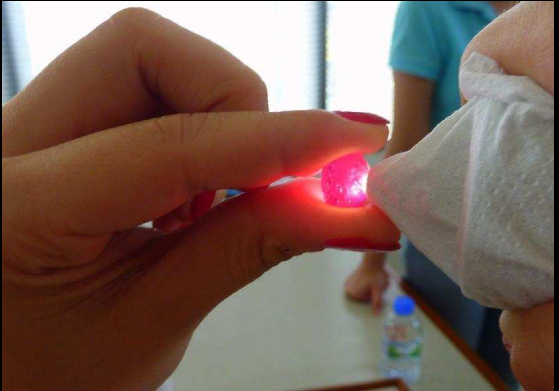
Rubelite seen at GEMBURI. CHANTABURI