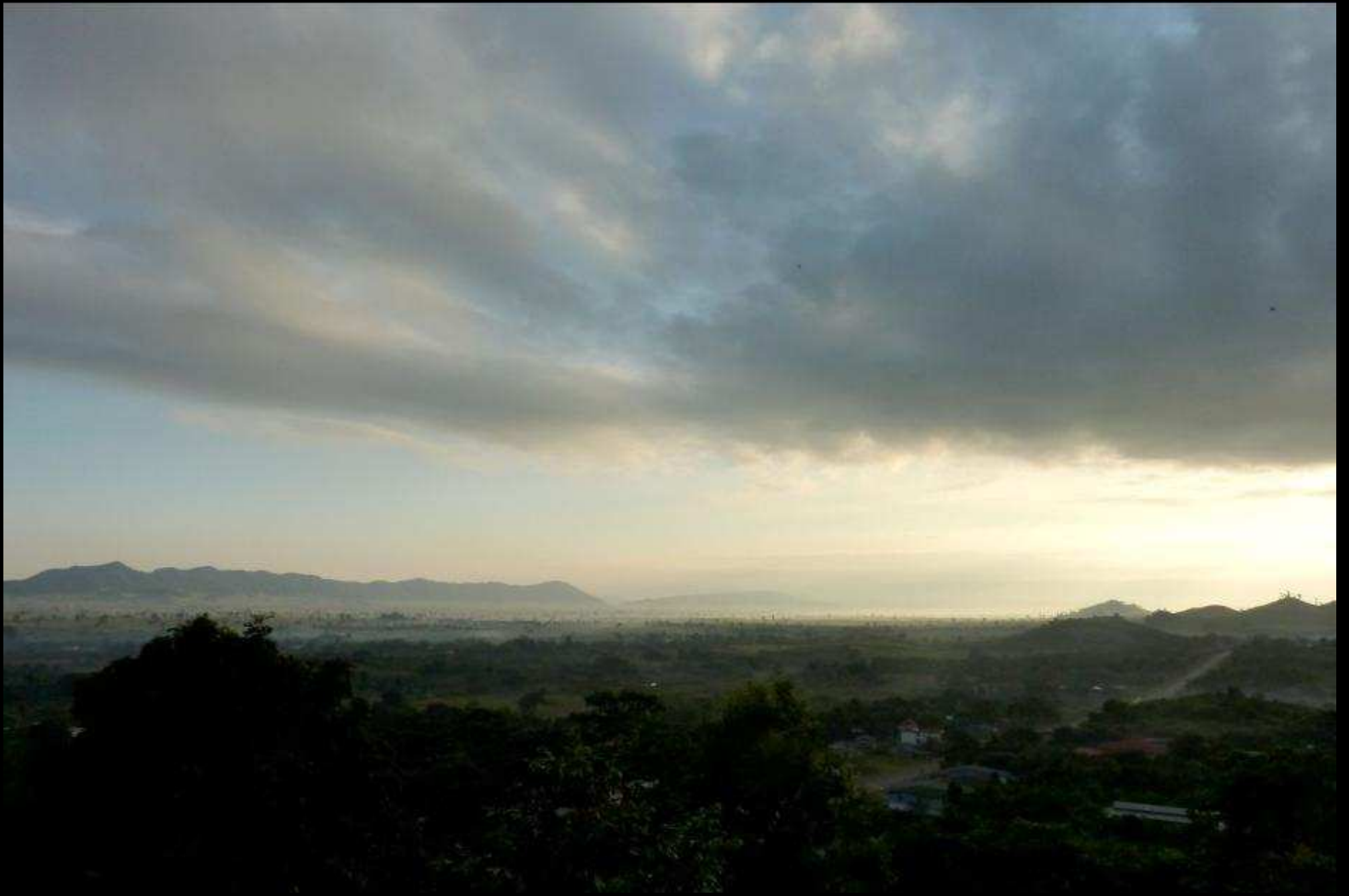
Early morning in PAILIN, Cambodia. View from the temple.