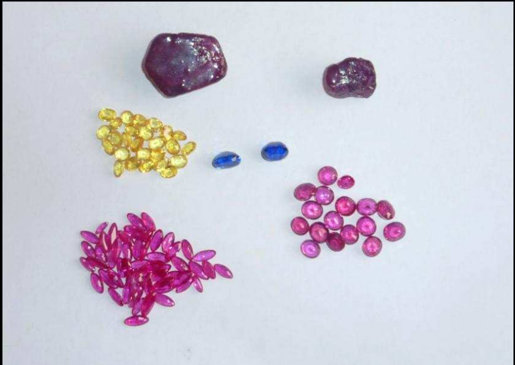
Sapphires and rubis seen at the main gems dealer office in PAILIN ( not all these gems are from pailin !)