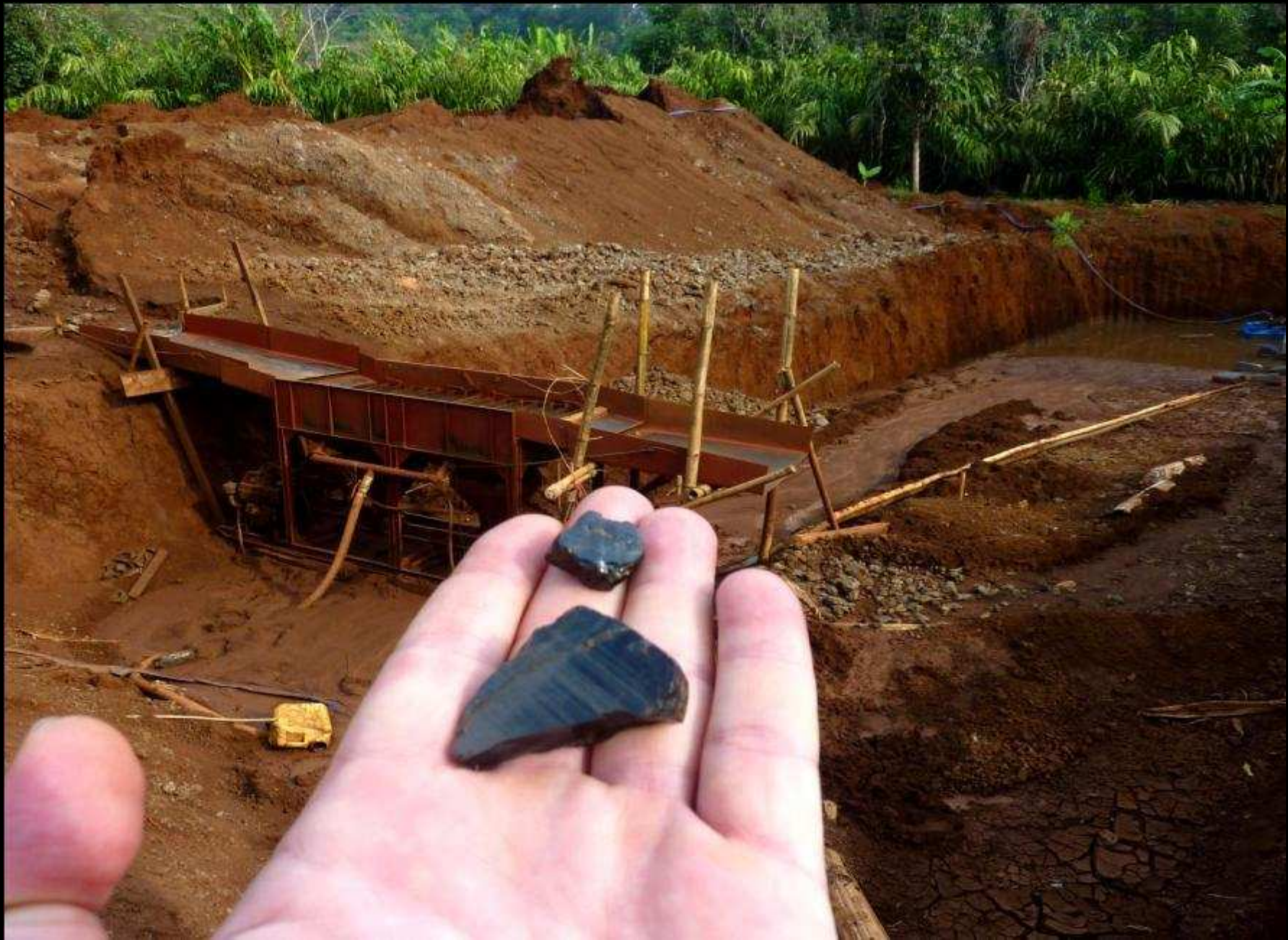
Black star sapphire in a small mine in CHANTABURI