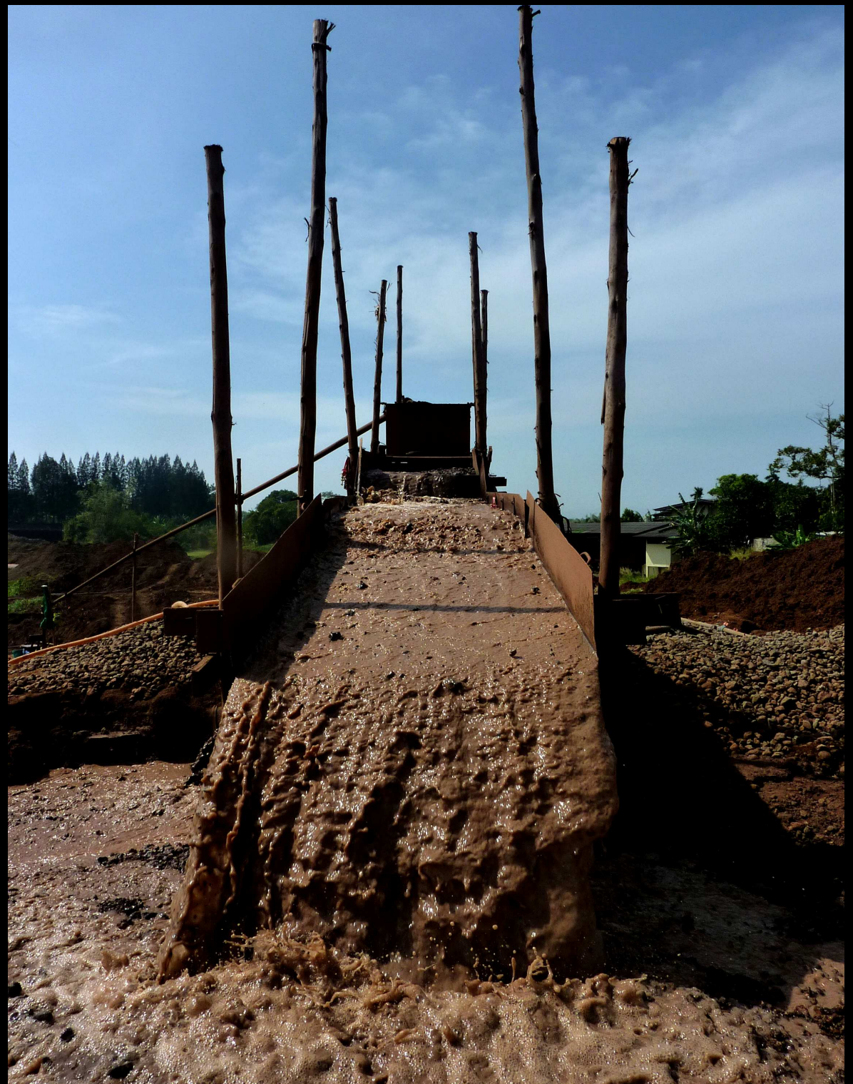
Large mining facilities in CHANTABURI