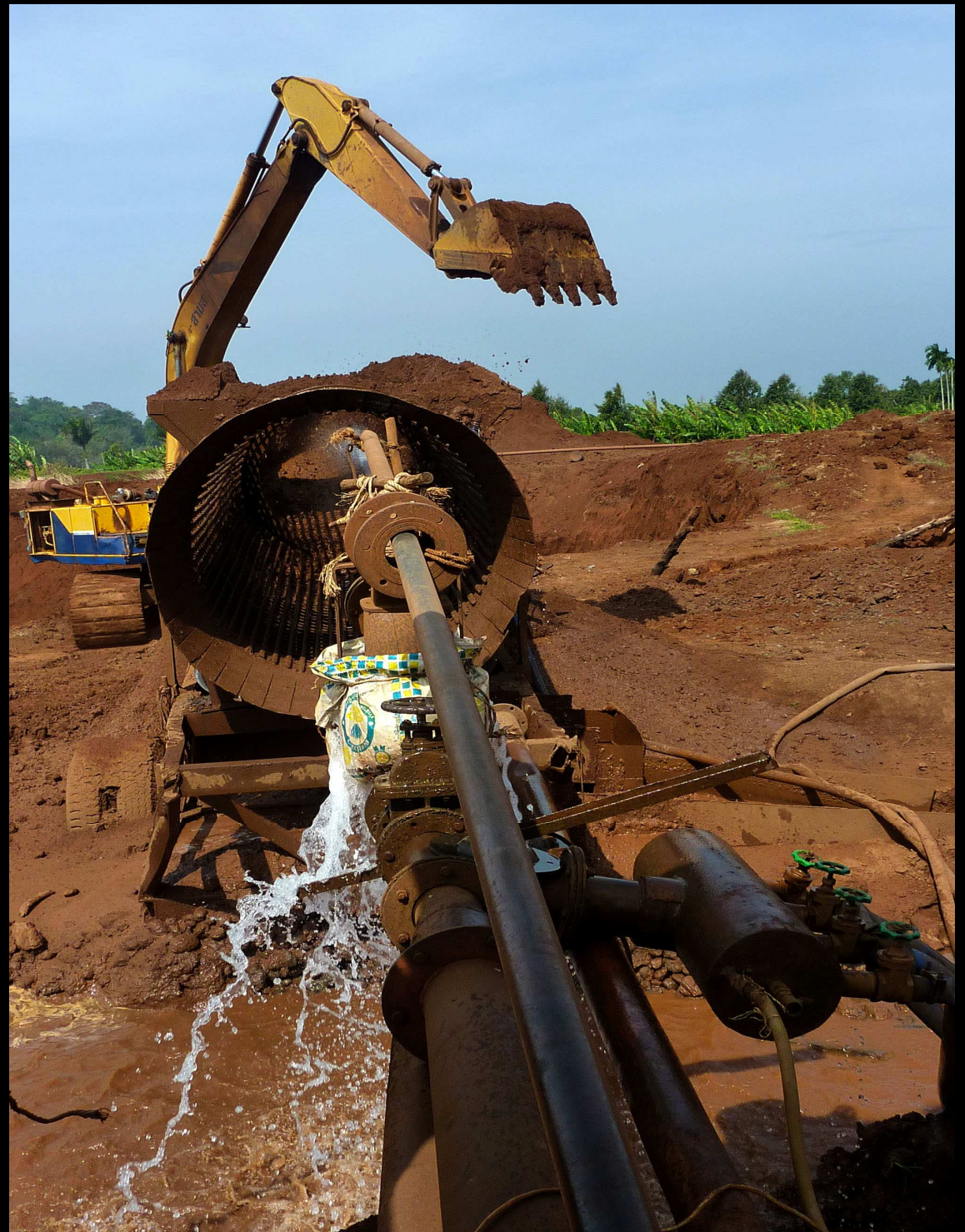
Washing process. Chantaburi.