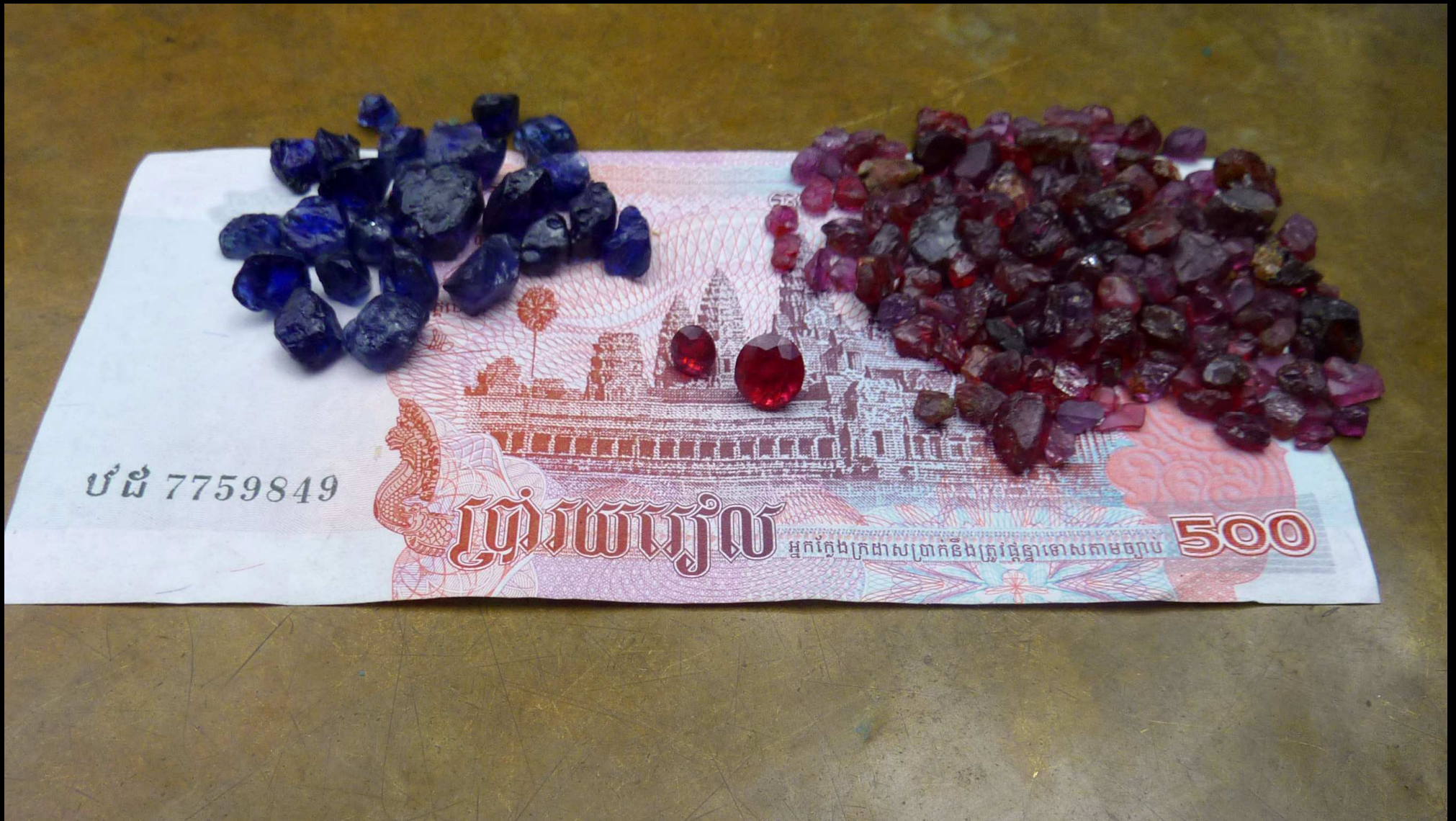
Sapphires and Rubies seen in Pailin Gems market. “Seen in Pailin” doesn't mean “From” Pailin !