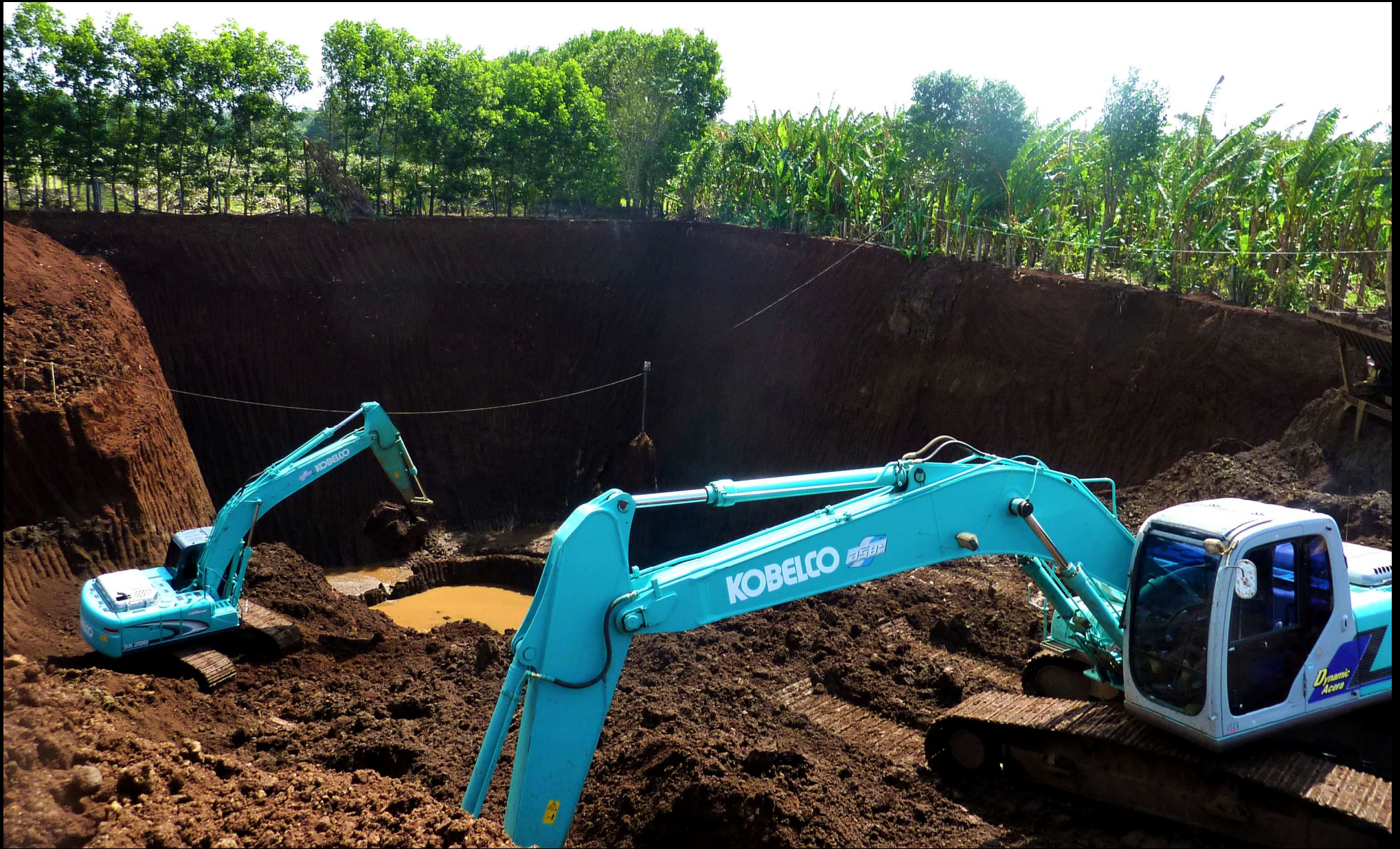
Excavators in action. Chantaburi