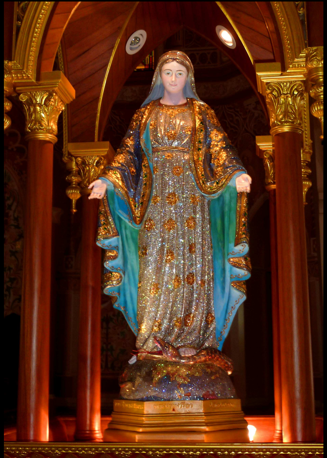
Immaculate conception. Virgin Marie in CHANTABURI cathedral with a dress made entirely of white and blue sapphire and ruby.