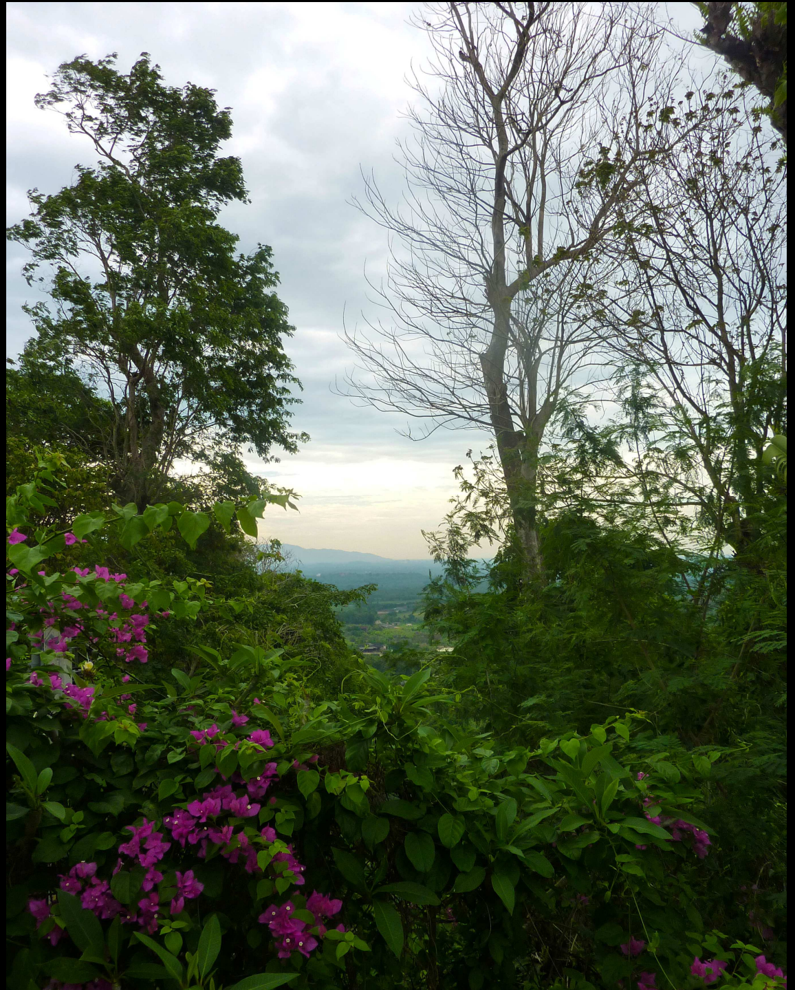
View from the Pagoda. Chantaburi