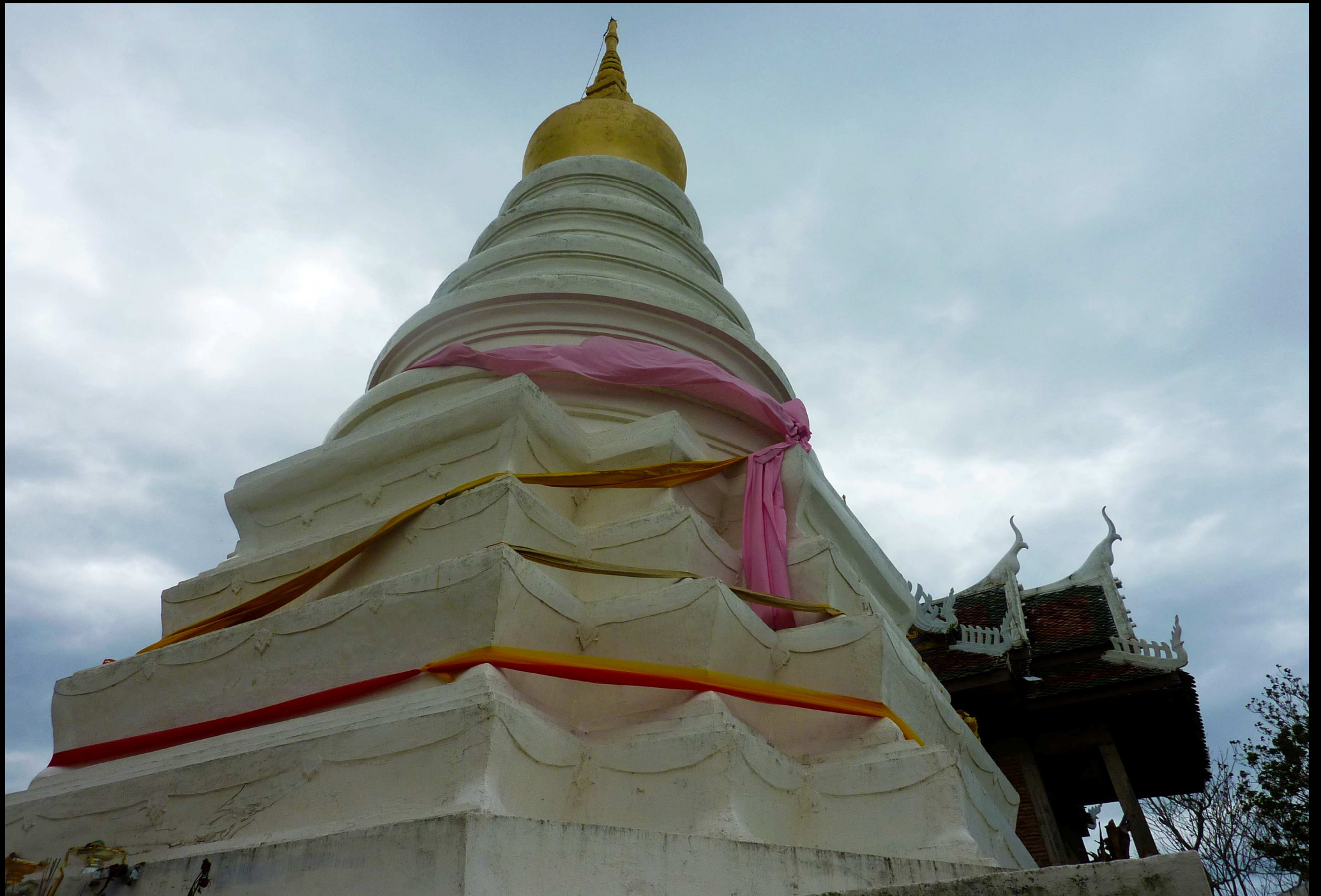
Pagoda and Mondop at Khao Ploywan.