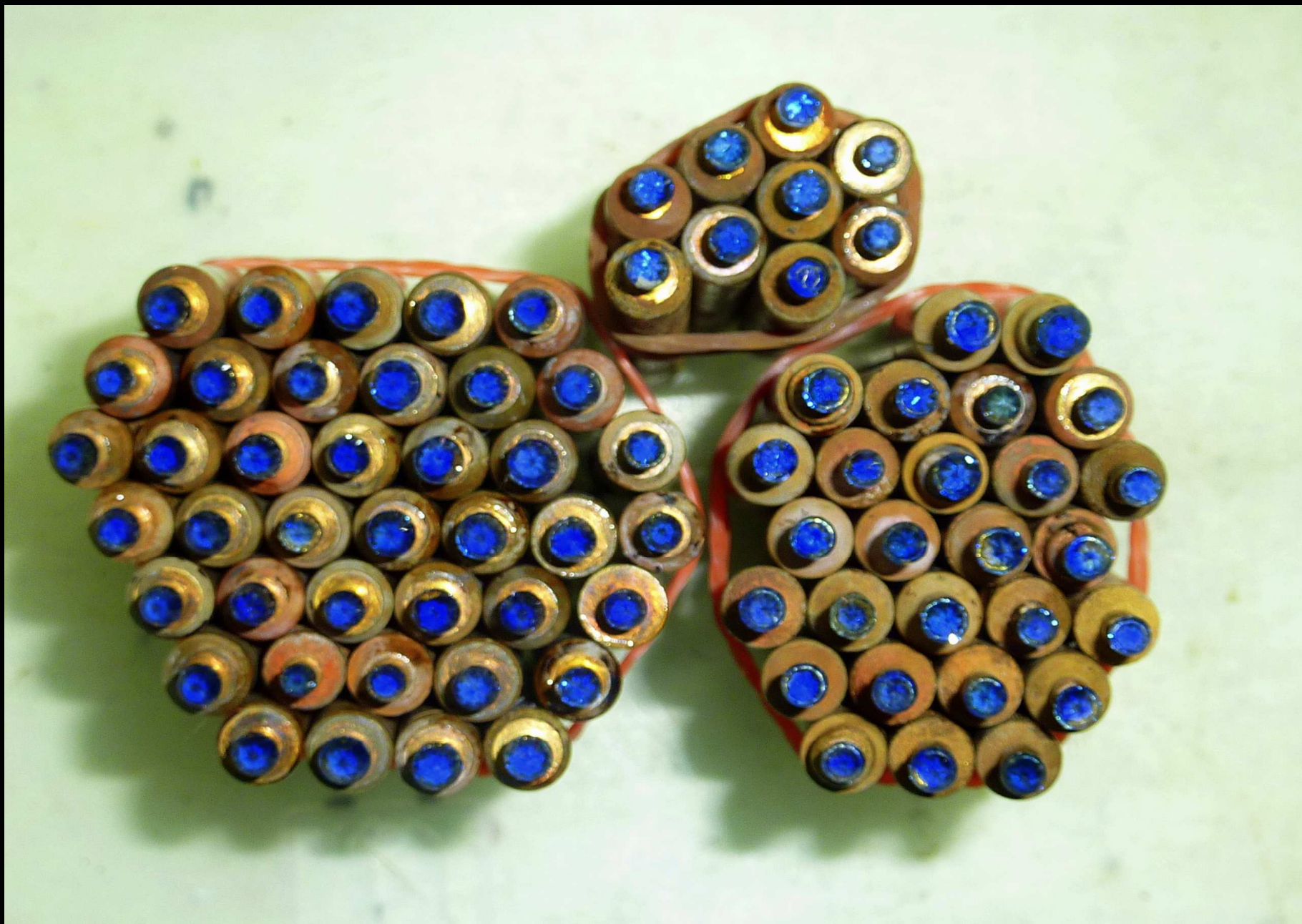
Faceting in progress. CHANTABURI.