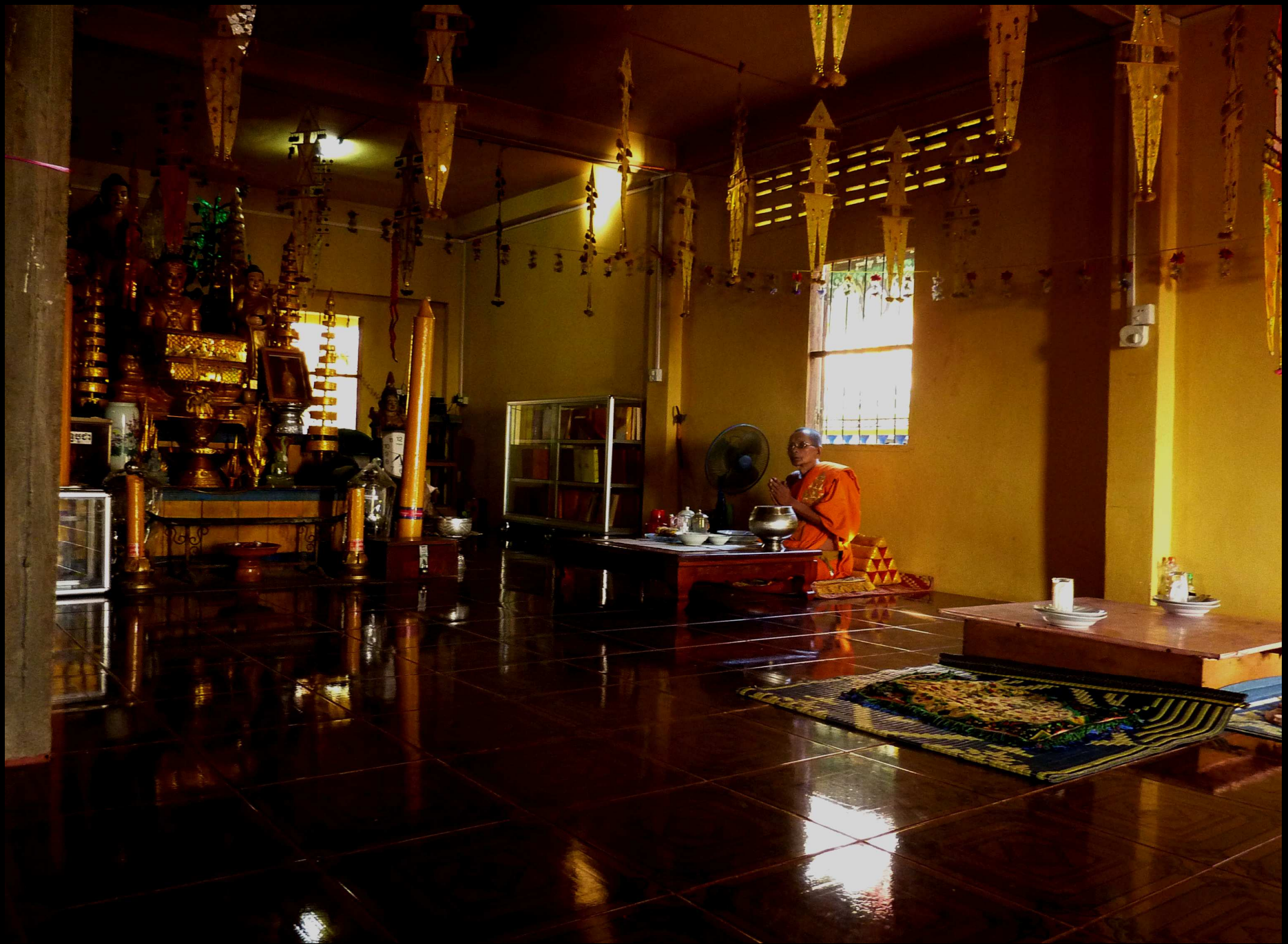
Monk in Pailin temple.