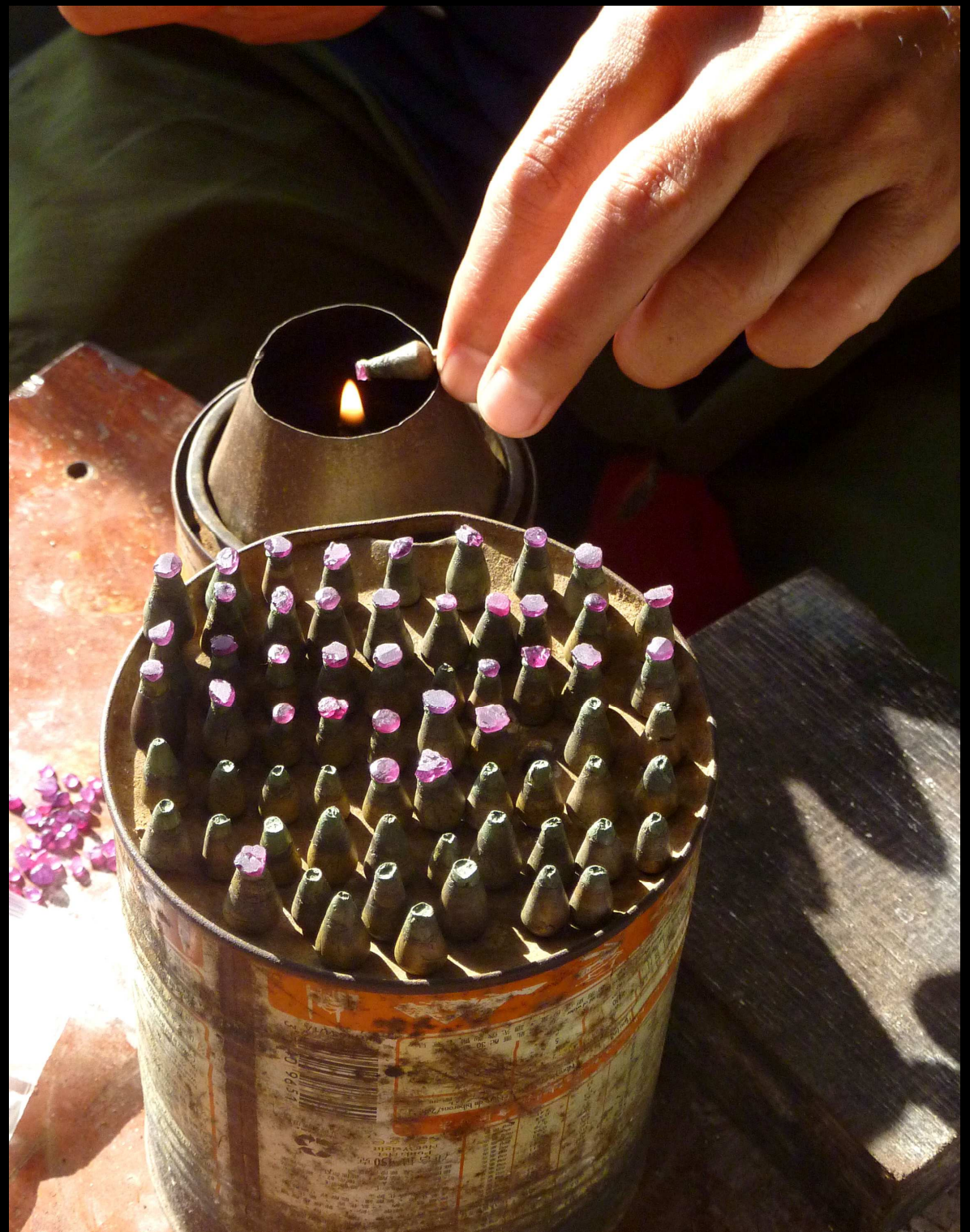
Ruby faceting in PAILIN Gems market