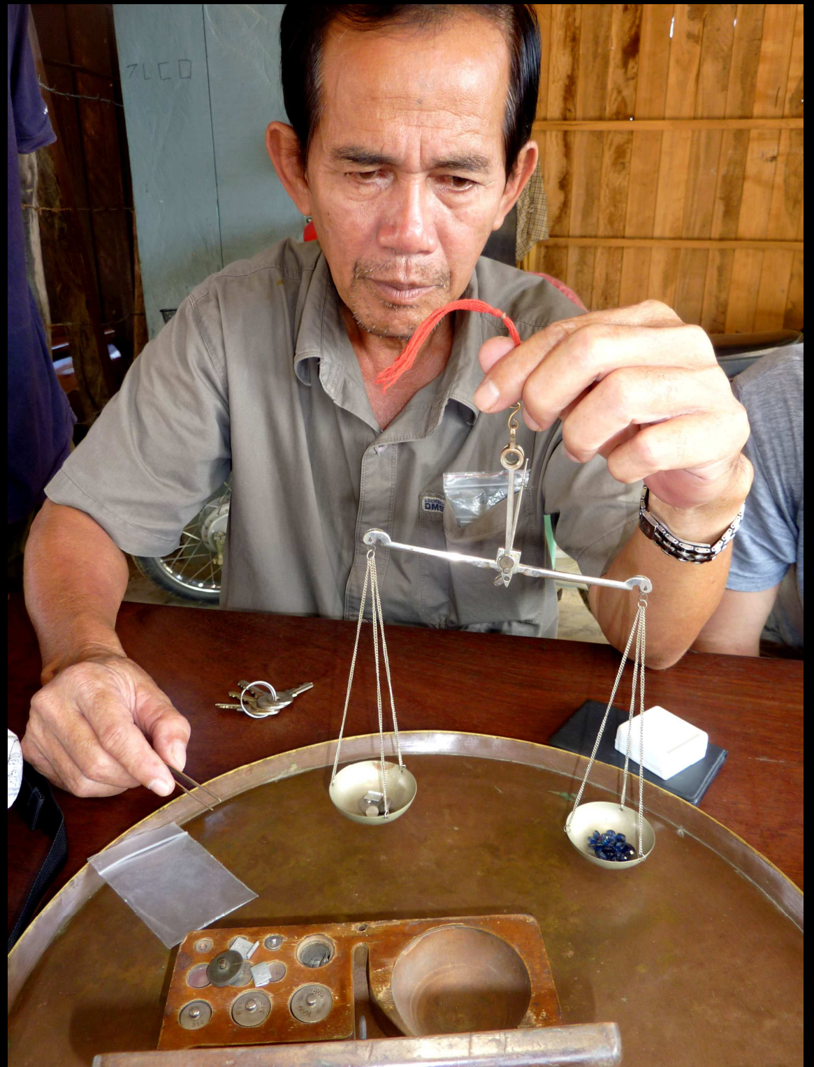
Gems dealer in PAILIN. Cambodia