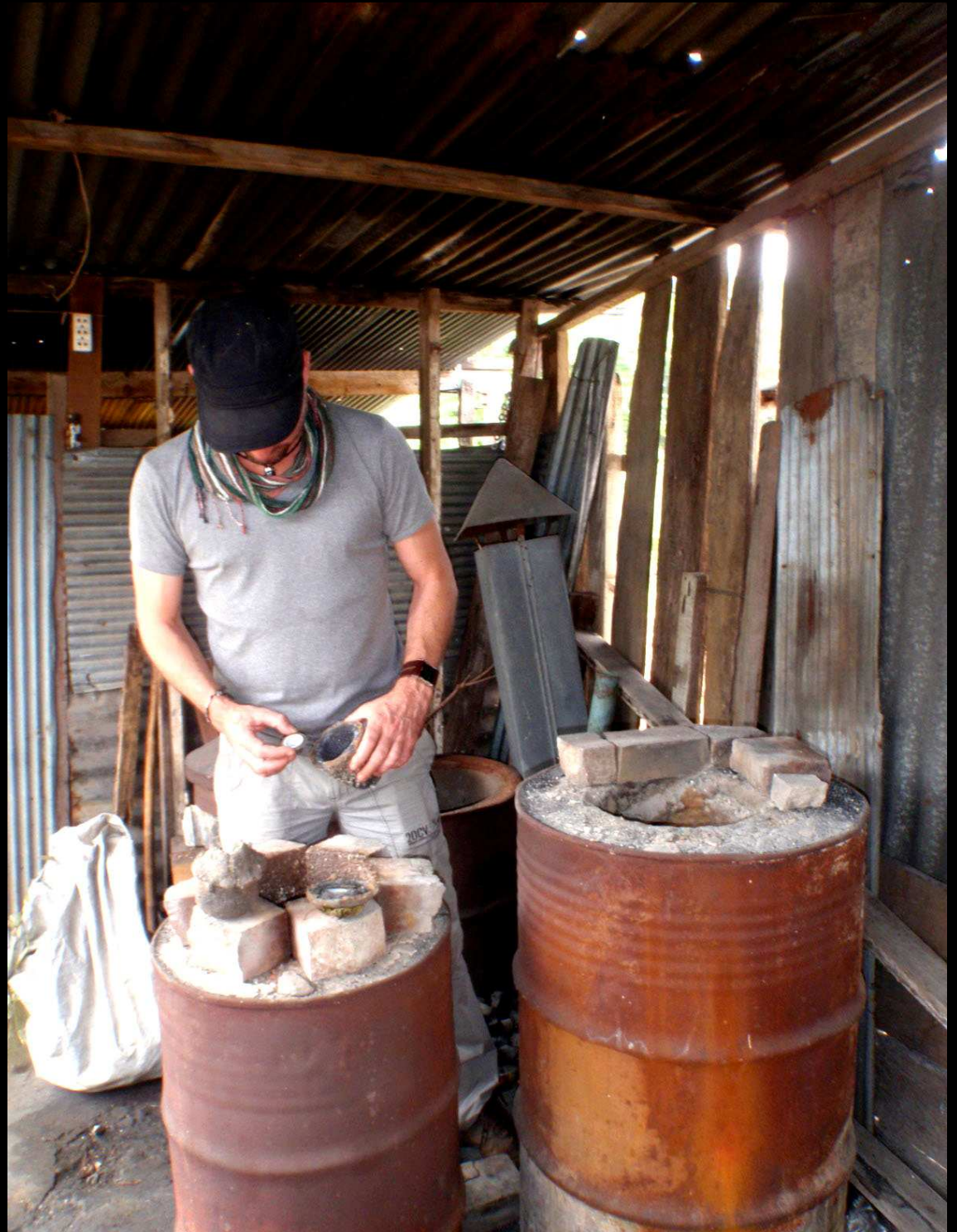
Traditional Thai burning furnace in PAILIN.