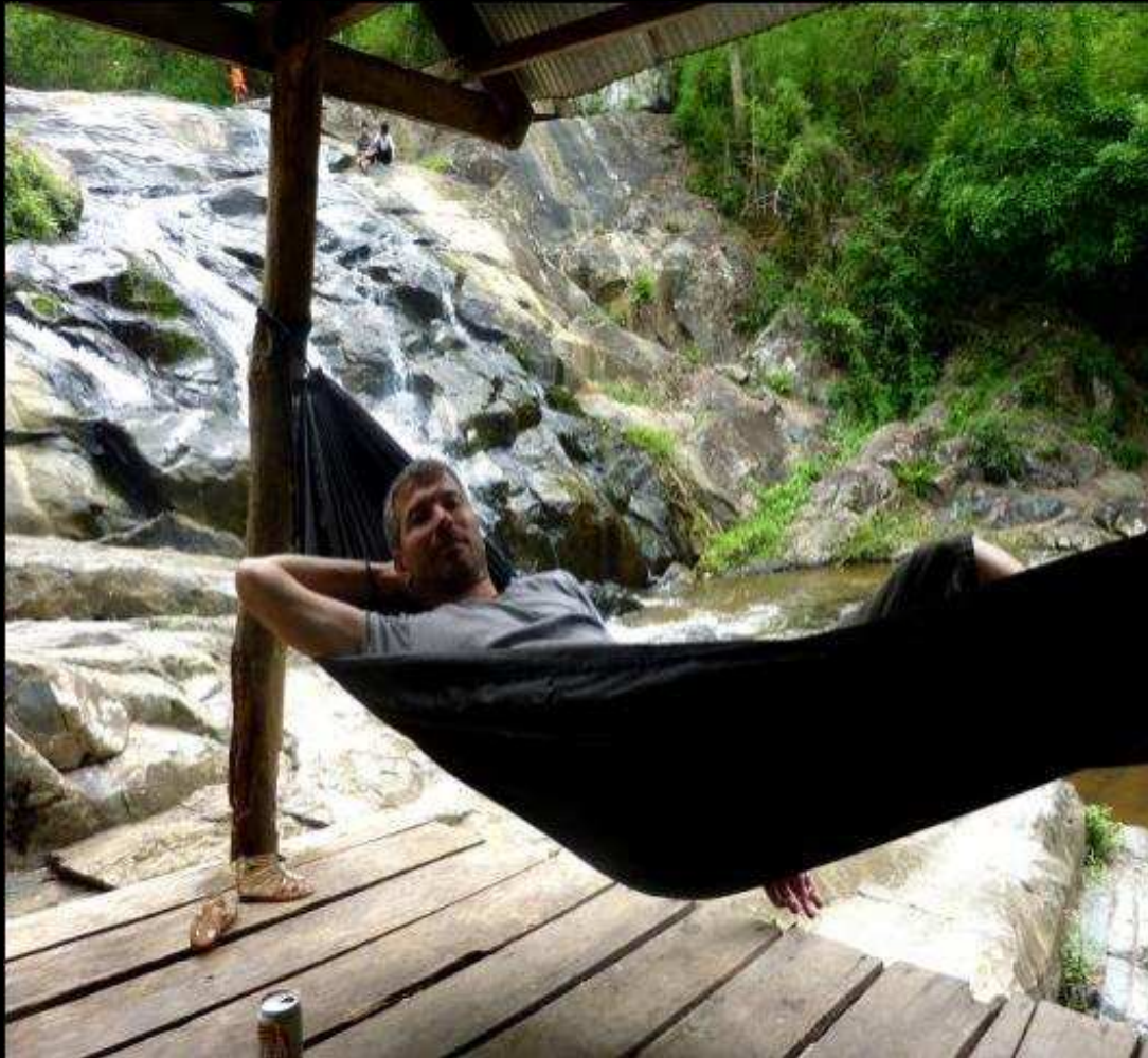
Lunch break. PAILIN waterfall Cambodia