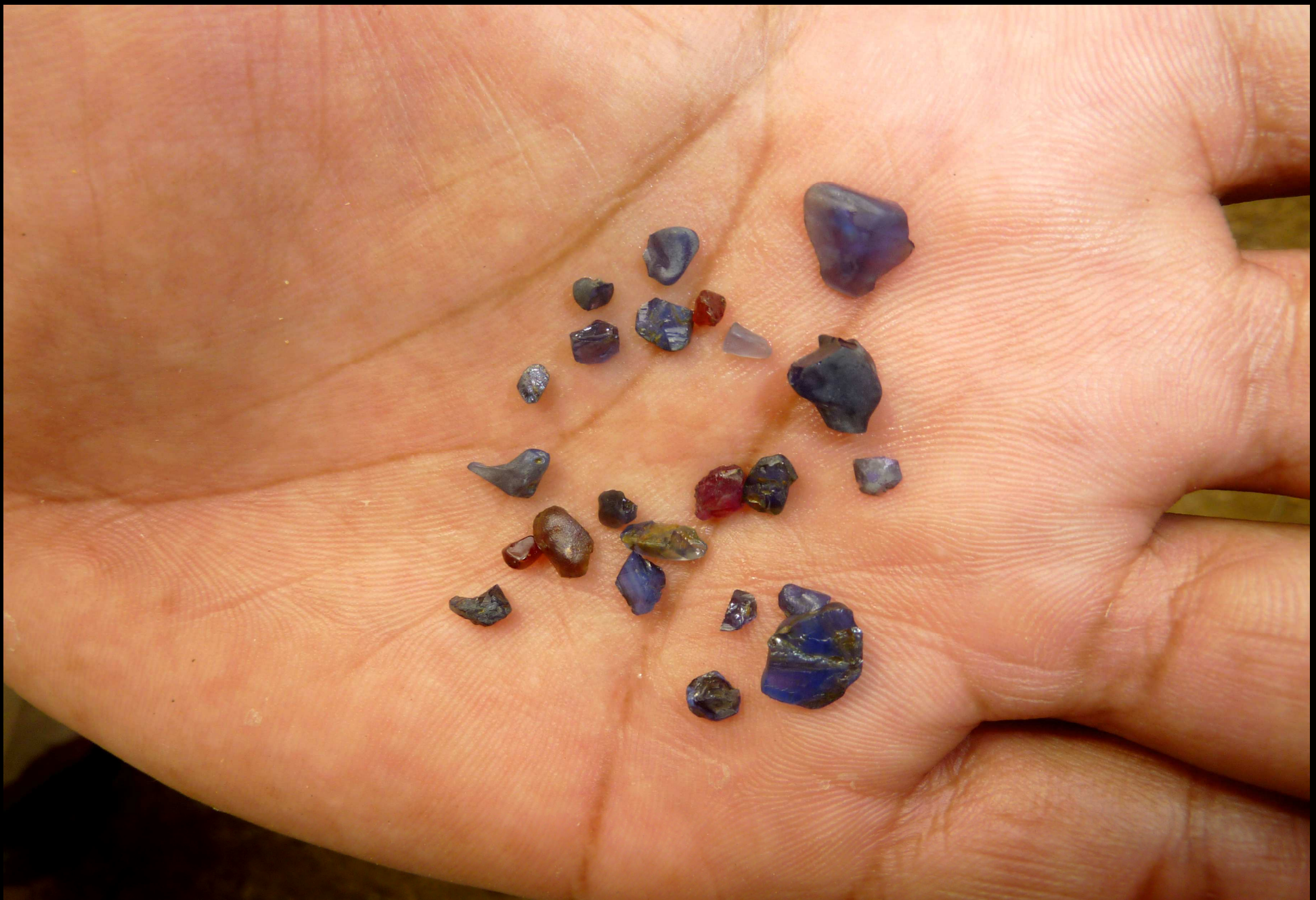
2 days production. Sapphires, Rubies, Garnets and zircons