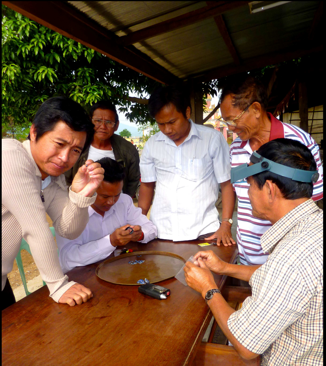
Gems business in PAILIN market.