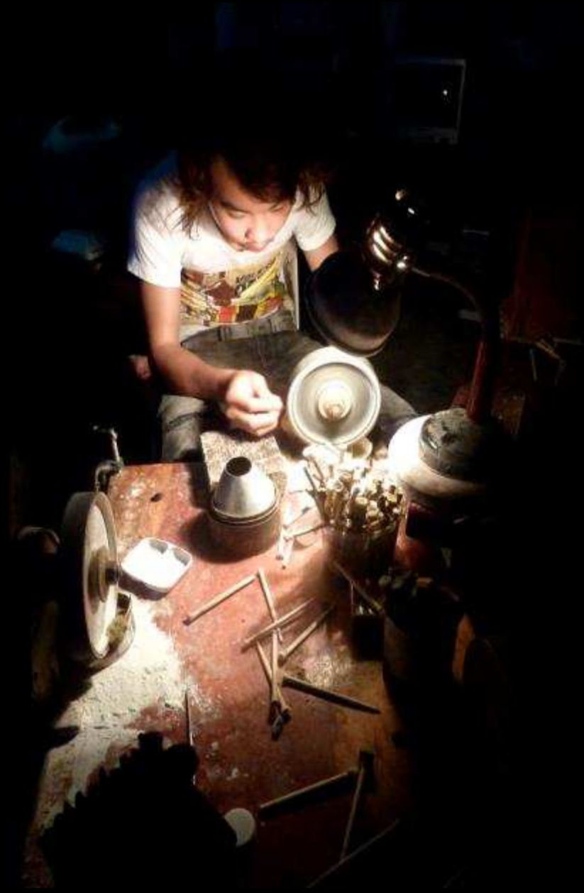
Night Cutting and faceting in PAILIN