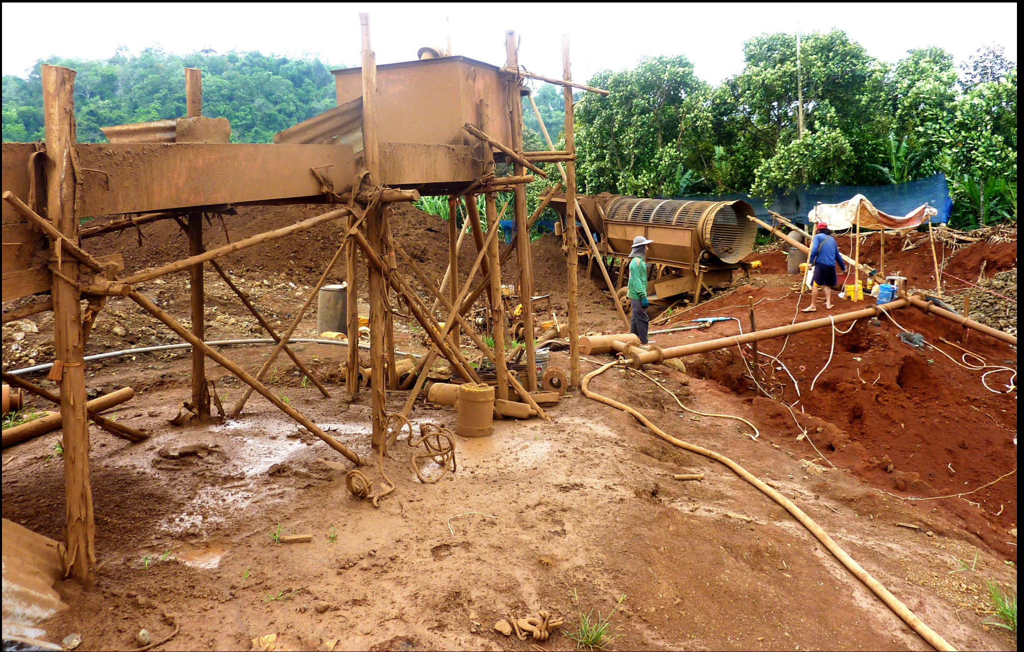
Closed view of sapphire mine in Chantaburi