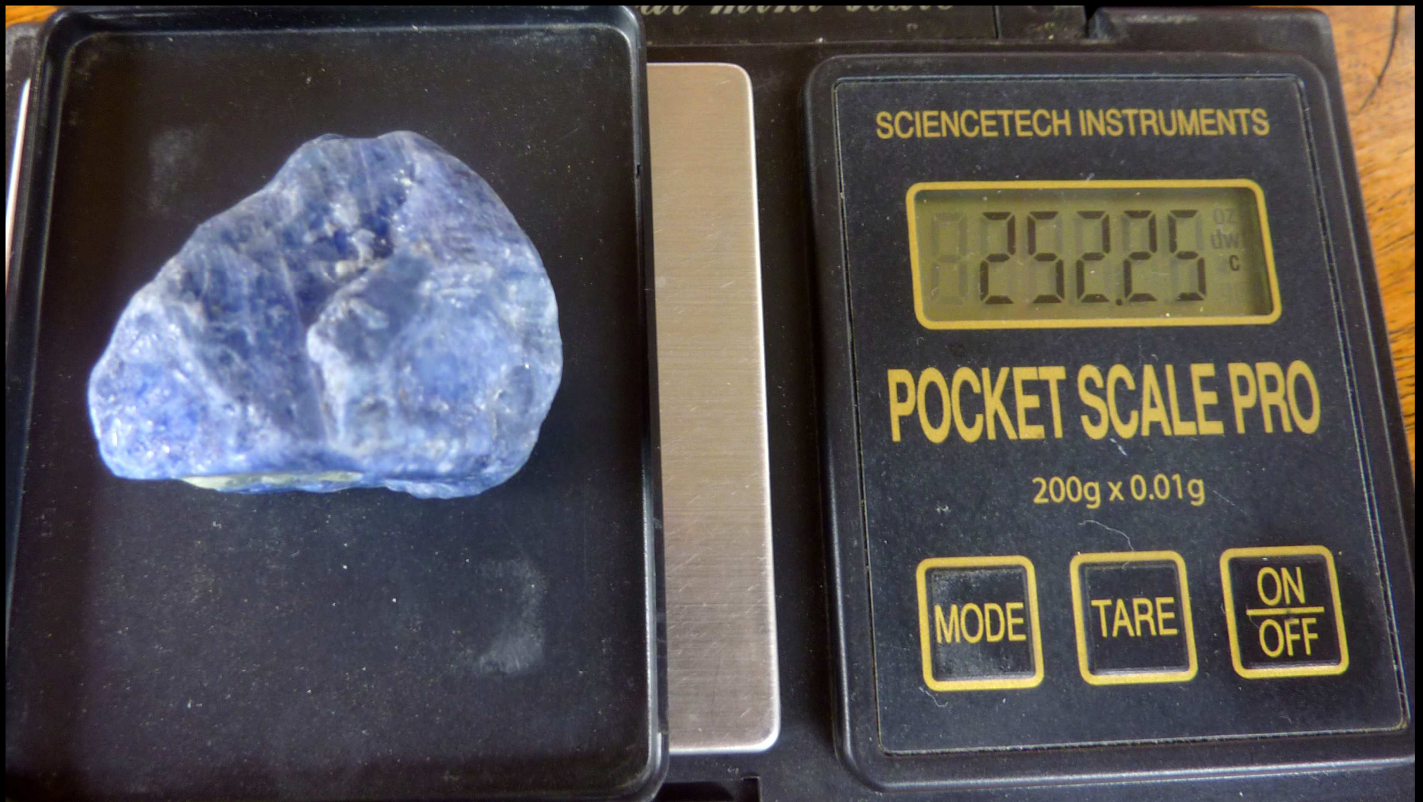
252 ct sapphire seen in Pailin Gems Market. Probably from somewhere else !