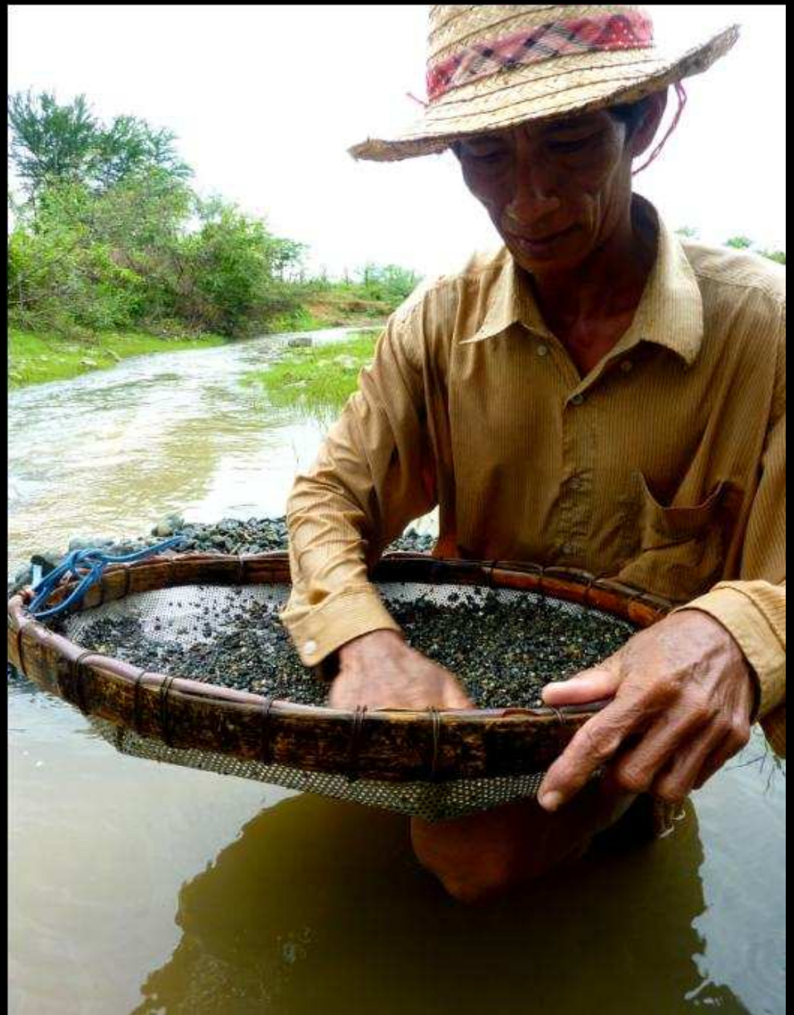
River mining in PAILIN.